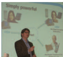
Niklas Zennstrom, co-founder and CEO of Skype, addressing WorkTech05.