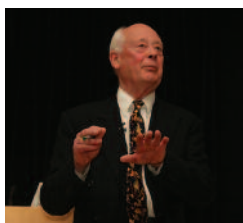
Charles Handy, one of the most respected authors and commentators on the future of work giving his presentation at WorkTech06.